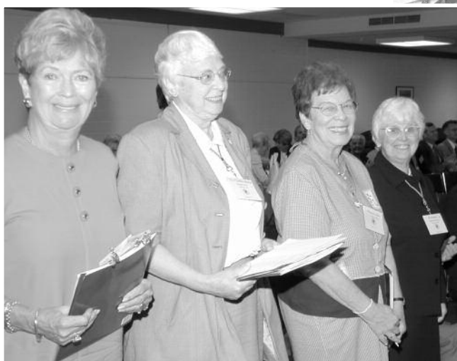
Proud members of the 50th Reunion class stand for their induction into The Golden Society.