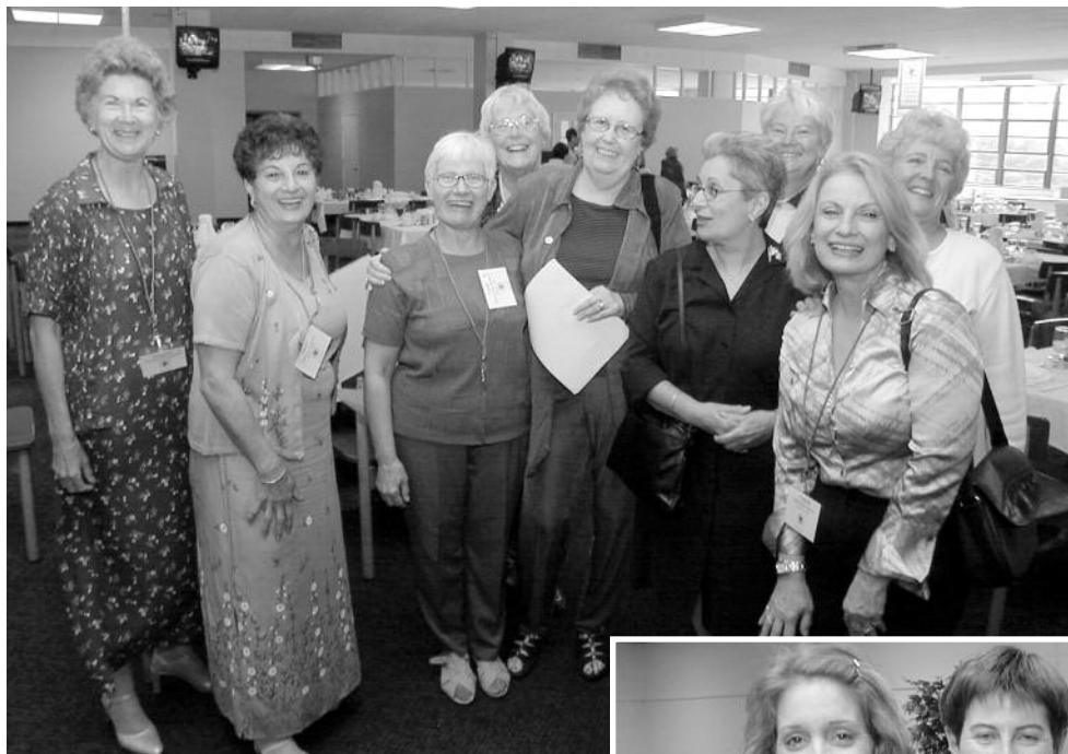
The “rowdy table” (AKA the class of 1961) takes a moment away from laughter and swapping memories to pose for a class photo.