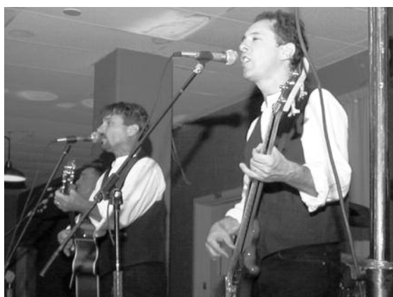
The Highland Rovers Band on stage in the campus pub.

Mark your calendars for the Annual Celebration of Saint Patrick! Saturday, March 16, 2002—with live music by The Highland Rovers Band.