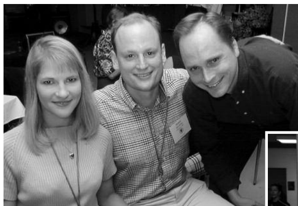
1991 classmates attend "Friday Night in the Pub."

Call your classmates and friends! Come back to alma mater in June!