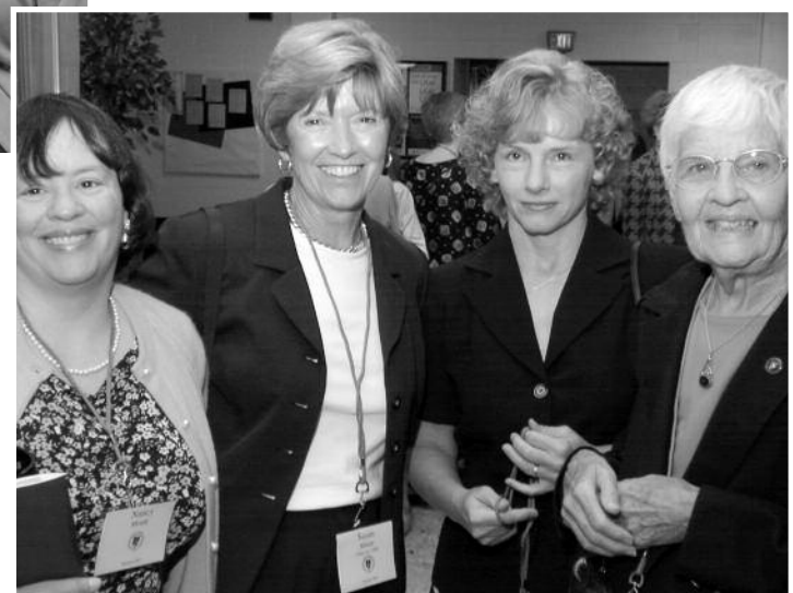
Reunion 2001 spans the decades!